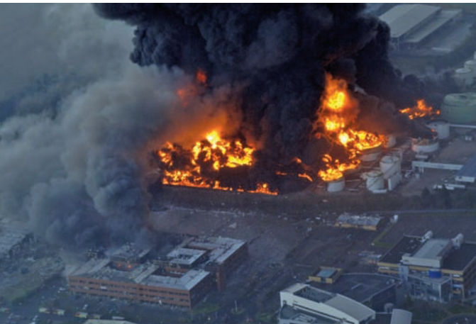
Fire at Buncefield Fuel Depot in Hemel Hempstead