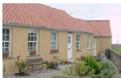
Wet render finish