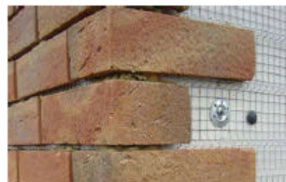
Brick slip cladding