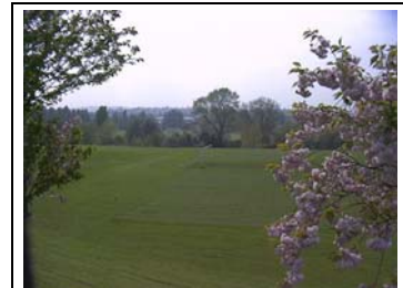
Figure 4- Views to the west

brickwork and white windows under a dark tiled roof.