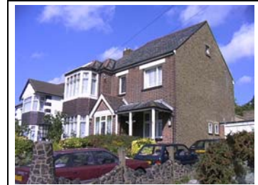
Figure 2- Typical properties

The houses built over a varying period from the 1930's to 1950's, are set above the road, being accessed by relatively steep drives with retaining walls abutting the pavement. They are generally individually styled; the majority are two storey brick with multi-faceted, flat topped bay windows or gabled bays and pitched roofs. There are exceptions- there are some bungalows, and some properties are rendered and painted- but the predominant appearance is of dark