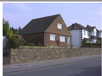
Figure 3- General view