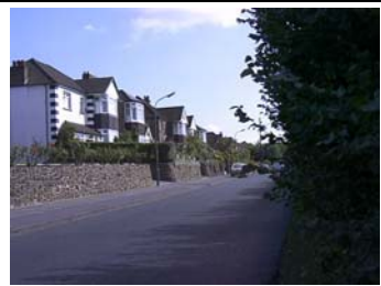
Figure 1- General view

This ASRC sits in a prominent position overlooking the Darent Valley and Central Park. The houses can be seen from a distance across the valley floor and therefore are important features in long views from the East. This part of Darent Road has development on one side. The opposite side of the road is given over to a substantial hedge which forms an important feature in the long views as it helps shield the traffic using this route. Without this natural feature vehicle movements would be very noticeable in the long view. The hedge therefore changes the apparent character from a through route to a more green setting.