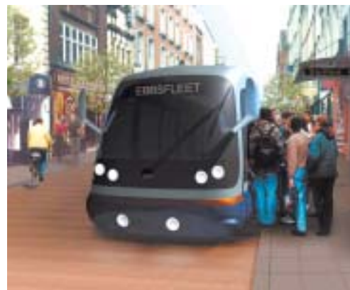
Bus for the future?

An effective transport system is crucial so that people can live their lives in a convenient manner and have access to their jobs, schools and leisure pursuits. In recent years, planning for transport has moved from a single option of planning for the private car to planning for choice ie a package approach based on flexible options - creating good public transport alternatives (the Fastrack initiative) and trying to plan for a network of local centres to serve the everyday needs of local communities so that they can walk or cycle to local shops for instance.