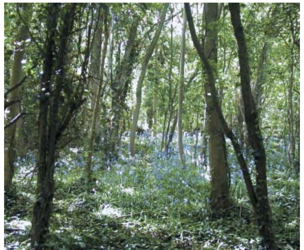
The environment is just one of a number of important issues where we need your views

existing planning policies have also supported these aims but with different degrees of success – we want to learn from experience and make future policies better at delivering development we can be proud of.