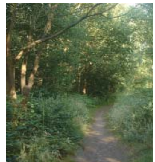
Dartford Heath is part of the Green Grid