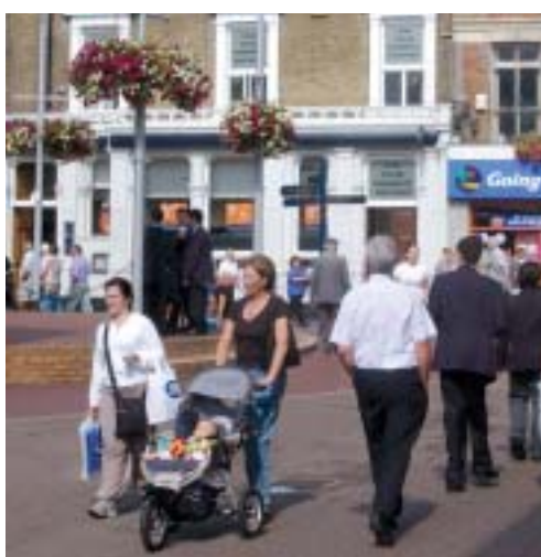
Well used streets allow for natural surveillance

Careful attention to planning and design early on in building developments can bring benefits in terms of minimising the opportunity for crime within communities. Well used or overlooked streets and spaces which allow for natural surveillance, especially around play-spaces and other communal areas can improve safety. Good lighting can help as well. Road safety issues can also be addressed through careful attention to connectivity and design.