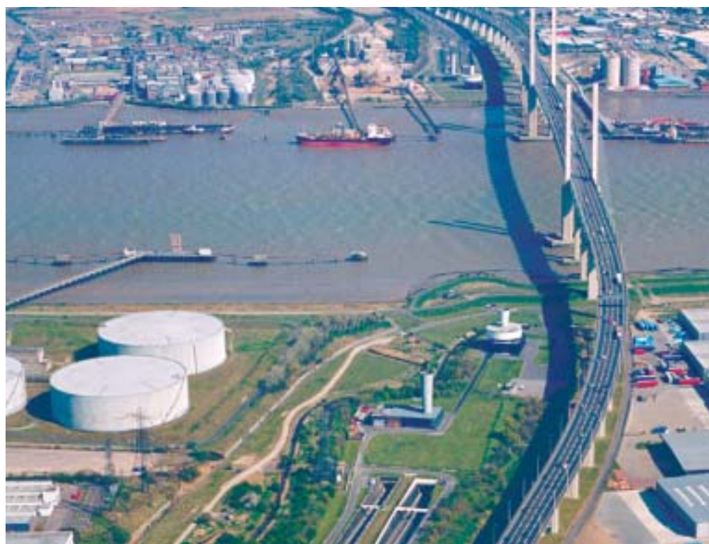
The River Thames could be a focus for new activities