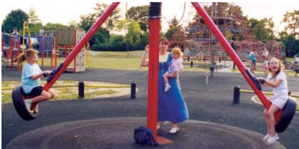
Adequate play space is an important consideration