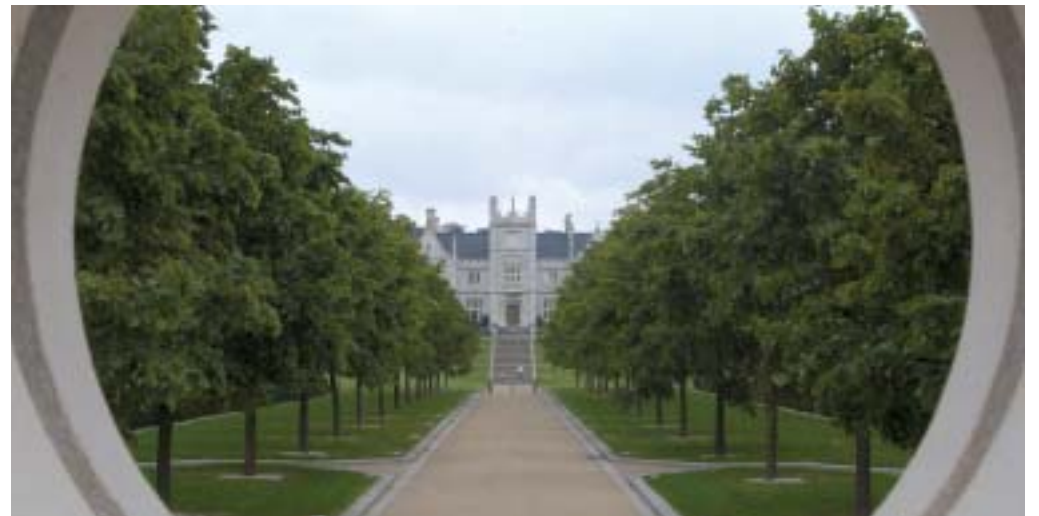
The restoration of Ingress Abbey as a focal point within Ingress Park