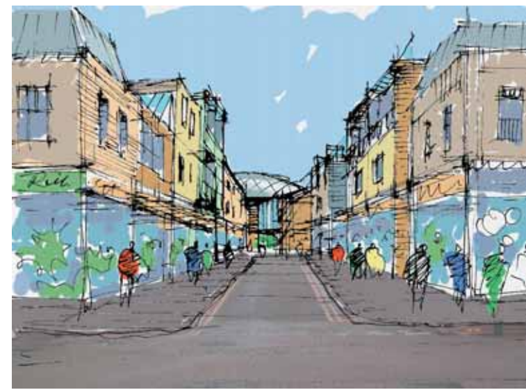
Proposed new town square