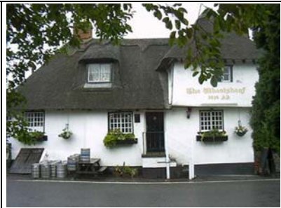
Figure 3- The Wheatsheaf

the area, but the listed ex- farm buildings are gradually being repaired and improved, and the well defined boundaries confining