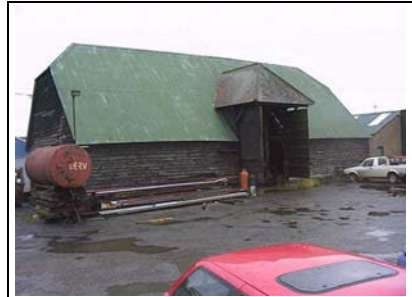
Figure 4- Westwood Farm

the area, but the listed ex- farm buildings are gradually being repaired and improved, and the well defined boundaries confining