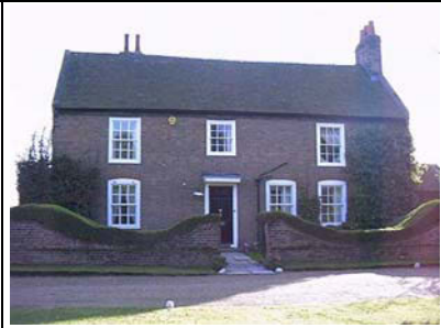
Figure 1- Ivy House

Several listed buildings are situated within Westwood Farm (Figure 4). Here the working environment as a small trading estate detracts from the overall character of