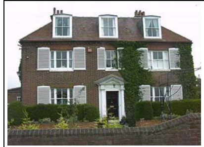
Figure 2- Westwood House

Several listed buildings are situated within Westwood Farm (Figure 4). Here the working environment as a small trading estate detracts from the overall character of