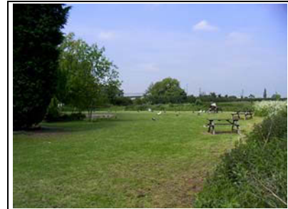
Figure 2- Picnic Area

The Area extends beyond the New Barn Road to the east, including Broadditch duck pond and a small picnic area wrapping around the rear of the pond. The road is very busy, and the provision of a small picnic area creates a small oasis off the road (Figure 2).