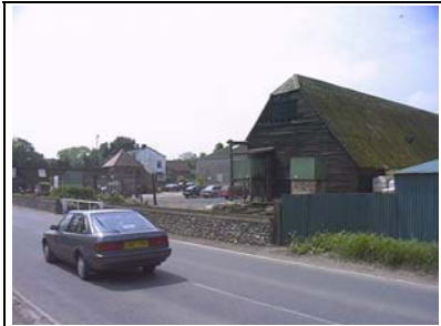
Figure 4- Manor Farm

The Broadditch Pond ASC is located around the junction of New Barn Road and Red Street, Southfleet. The current designation includes the farmyard to Manor Farm, which contains an imposing timber clad barn (Figure 4). Manor Farm House is substantially set back from the road and is almost lost behind hedges.