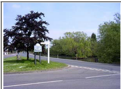
Figure 3- The green

The junction with Red Street is formed by a small green complete with an old finger post sign (Figure 3). To the