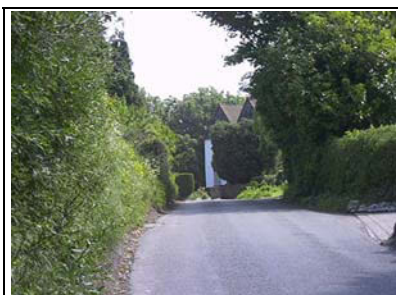
Figure 5- Rosedale

south west is the grade II listed Wastdale (Figure 1), almost hidden by a hedge. Continuing westwards the properties of Rosedale and Suki complete the Area- Rosedale forms an important terminus to the vista travelling east along Red Street (Figure 5).