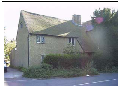
Figure 1- Wastdale

The junction with Red Street is formed by a small green complete with an old finger post sign (Figure 3). To the