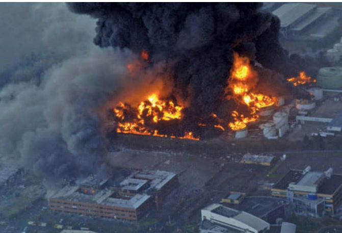
Fire at Buncefield Fuel Depot in Hemel Hempstead