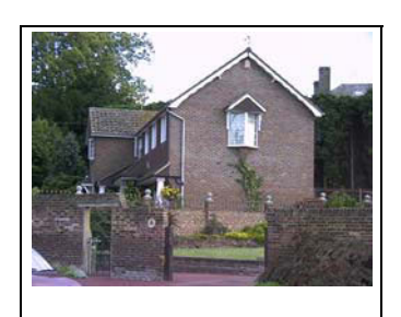
Figure 5- Station Road (south side)