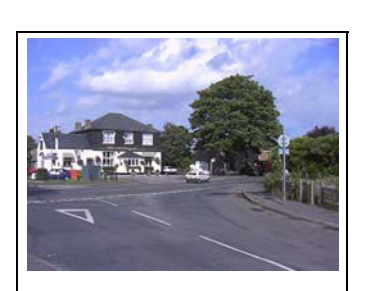
Figure 1- The crossroads

The village of Betsham is designated as an ASRC. The focus of the village is the junction of Betsham Road, Station Road, Park Corner Road and Westwood Road. Surrounded by farmland and approached through hedged country lanes, Betsham has a varied character. The central area includes a petrol station, a public house (The Colyers Arms Figure 1) and a Grade II listed building (Betsham House) together with some large trees. However the central area is also