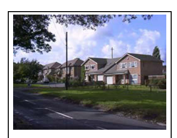
Figure 2 - Broomhills

To the north west, Broomhills consists of modern houses (Figure 2), which have been built as one development,