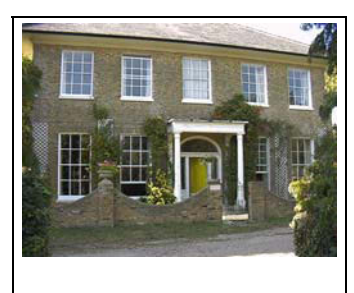
Figure 3- Joyce Hall

Station Road has two distinct characters either side of the road. The northern side comprises mainly bungalow development (Figure 6) apart from properties adjacent to the public house, and gardens are generally open plan to the road. In