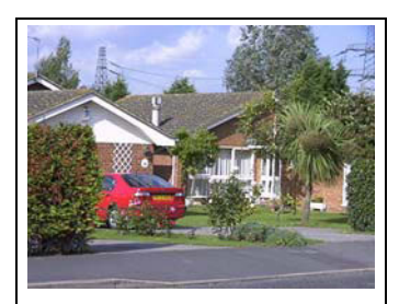
Figure 6- Station road (north side)

Park Corner Road is dominated by the petrol station at the junction, but then changes into a ribbon development on the western side of the road with varying styles and ages of domestic