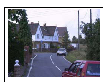
Figure 4- Park Corner Road

are consistently detailed and are of similar scale and materials of brick and tile.