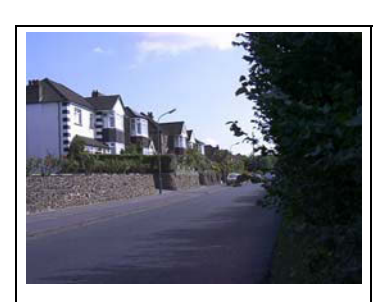
Figure 1- General view

This ASRC sits in a prominent position overlooking the Darent Valley and Central Park. The houses can be seen from a distance across the valley floor and therefore are important features in long views from the East. This part of Darenth Road has development on one side. The opposite side of the road is given over to a substantial hedge which forms an important feature in the long views as it helps shield the traffic using this route. Without this natural feature vehicle movements would be very noticeable in the long view. The hedge therefore changes the apparent character from a through route to a more green setting.