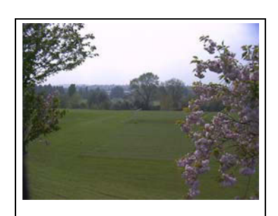
Figure 4- Views to the west

brickwork and white windows under a dark tiled roof.