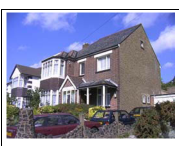
Figure 2- Typical properties