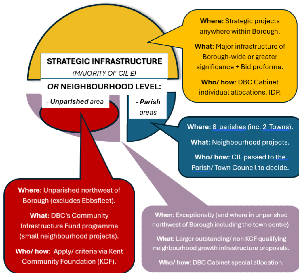
Figure B: Illustrative Summary of Dartford CIL infrastructure delivery arrangements