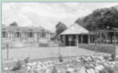
Garden for the Blind, opened in 1960

In July 1960 a special garden for the use of blind people was paid for by Dartford and District Round Table. The Dartford Harriers' grass running track was replaced in 1968 by a cinder track.