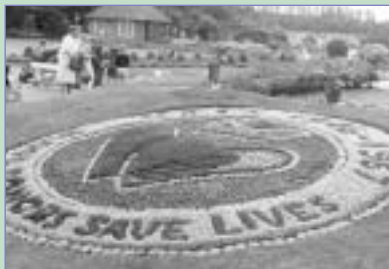
Floral carpet bed, Central Park, 1967

In the 1950s a carpet bed was constructed on which floral displays could be laid out to mark various events or anniversaries. This is still done today.