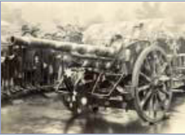
German field gun presented to Dartford in 1919 by the Australian government

In 1915 the Council purchased 16 acres (6.5 hectares) of meadows bordering the River Darent and stretching southwards to the area now covered by the running track. This area, known as the Central Park Extension, first opened to the public in May 1916 but closed about one month later due to lack of staff. It opened again in 1921, having gained a lake. In 1927 it was closed again, levelled and reseeded with grass before opening for good in May 1931.