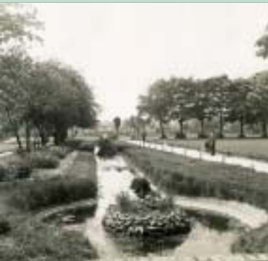
View of lily pond in Bank House extension, looking south towards original Central Recreation Ground, 1917

Lieutenant-Colonel Kidd believed that the Recreation Ground could be self-supporting if the Council was to charge admission for entertainment on 12-13 days a year. If the Council did not want to accept the gift, he was prepared to hand over a cheque representing the value of the land instead, to be spent for the good of the townsfolk.