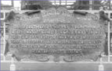
Plaque commemorating the donation of the original Central Recreation Ground.