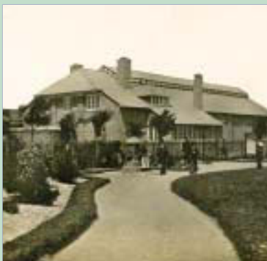
Drill Hall, Central Park