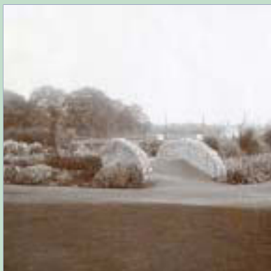
Part of medieval town bridge, rebuilt in Central Park in 1923

In 1926 Market Street was constructed through part of the grounds behind Bank House in order to give greater access to the park and library.