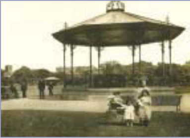
Band stand in Central Recreation Ground, prior to 1910