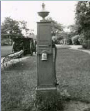
The old town pump which stood in Central Park from 1906 until 1953

In 1906 the old town pump, originally sited in the High Street, was placed in the Recreation Ground where it stood until 1953.