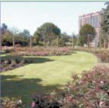
The rose garden

The informal areas of the park include large stretches of grass, junior football pitches and walks by the river. The southern end is home to the Dartford Harriers running track and pavilion. Central Park hosts numerous events, particularly in summer, including the popular Dartford Festival weekend in July. There are public conveniences and a small car park near the Cranford Road entrance at the southern end of the park (next to Fairfield Pool), and conveniences just outside the park in Market Street. Central Park is monitored by CCTV. For further information, telephone the Civic Centre.