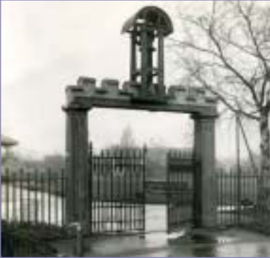
The market bell and gates were moved to Central Park in the late 1920s

In July 1937 a scheme to build a very large Municipal Building in Central Park, near the Library, was dropped due to public objection. In the same year a bowling green and a children's paddling pool appeared.